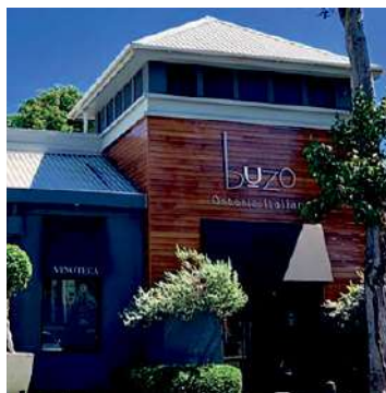
Buzo Osteria Italiana ranked at 41 and was named 'The Best Restaurant in the Caribbean 2025.'

Their inclusion on the list marks a major win not only for the restaurants but for Caribbean gastronomy as a whole. As noted by Bon Appétit,