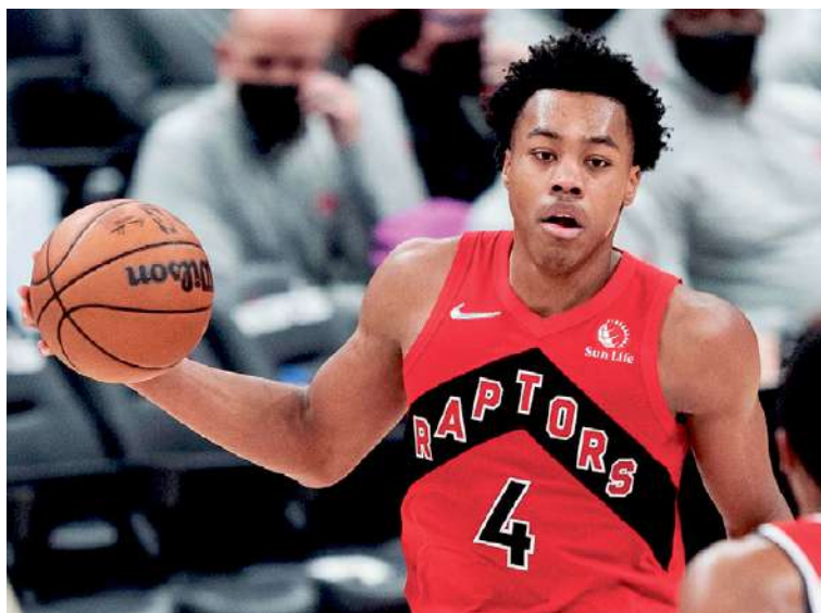
Toronto Raptors forward Scottie Barnes is reportedly in talks to join Jamaica's national team for the FIBA 2027 Americas Pre-Qualifiers.

Since entering the league in 2021, Barnes has quickly