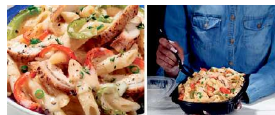
Jerk Chicken Pasta is back on the menu at Golden Krust for a limited time. (Contributed image)

The menu addition builds on Golden Krust's legacy of bringing authentic Jamaican flavors to mainstream audiences. Founded in 1989 in the Bronx, New York - where its first restaurant still operates - the