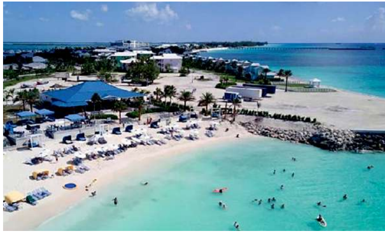
Floridians can now fly non-stop from MIA to Bimini, Bahamas on American Airlines.

two hard-to-reach Caribbean gems more accessible with new nonstop flights from Atlanta's Hartsfield-Jackson International Airport to Grenada, (GND) and St. Vincent and the Grenadines, (SVG), starting December 20, 2025.