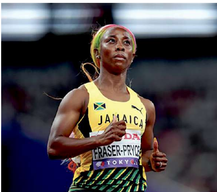
Jamaican sprinter, Olympian Shelly-Ann Fraser-Pryce, retired from athletics after winning silver in the World Championships last month.

Fraser-Pryce is not the first celebrity to be targeted by such fabricated AI-driven content. Similar viral posts claimed NBA star Ja Morant had secured a US$13.5 million Netflix deal, American broadcaster Stephen Colbert had signed with the