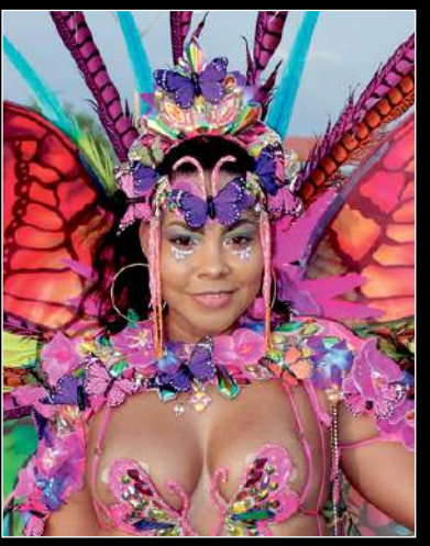
Countdown On To Miami Carnival ... Page 11 (Miami Carnival image)