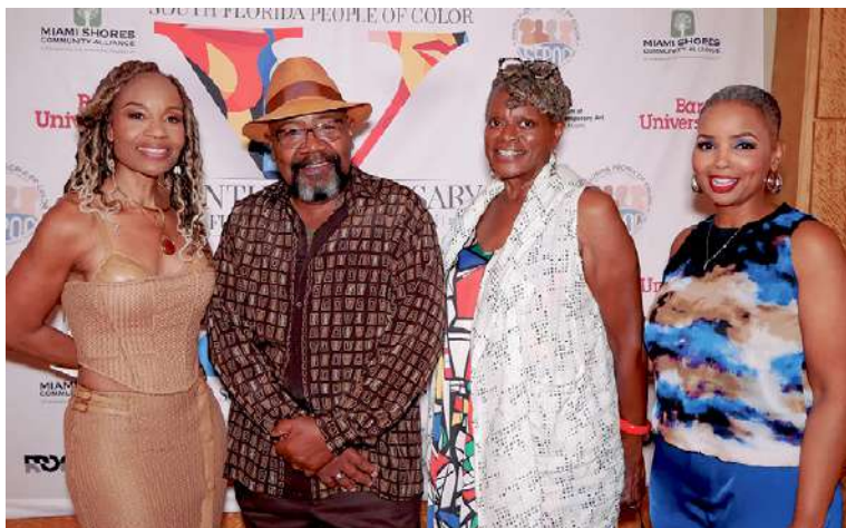
The South Florida People of Color recently turned 10 and marked its birthday at the Lyric Theater in Overtown.