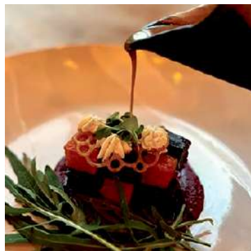
This amazing dish from Stush in the Bush is on the menu at the Jamaican restaurant.