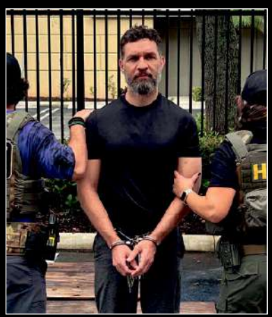
Caribbean Nationals ICED ... Page 3 (Dimitri Vorbe ICE image)

THE MULTI-AWARD WINNING NEWS MAGAZINE WITH THE LARGEST PROVEN CIRCULATION IN FLORIDA GUARANTEED