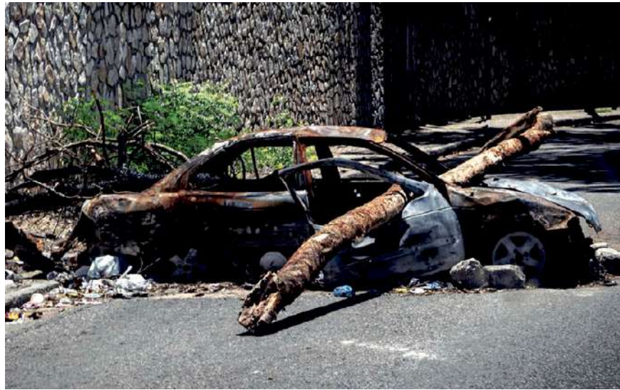
A burnt-out car serves as a barricade on a street in Port-au-Prince. With over 150 gangs operating in and around the country, all roads access in and out of Haiti's capital are now under some gang control.

A 16-year-old boy has been charged in connection with a mass shooting that left two men dead and five others injured in New Providence last month. The teenager appeared before Chief Magistrate Roberto Reckley on September 29th facing two counts of murder and five counts of attempted murder stemming from the August 9 attack. Police said victims were gathered outside a home when