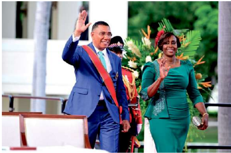
Jamaica's PM Andrew Holness and his wife ahead of the swearing in ceremony on Sept. 16, 2025.