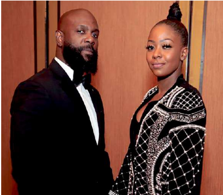
Bunji Garlin and his wife Fay-Ann Lyons from Trinidad and Tobago will headline the Miami Carnival.