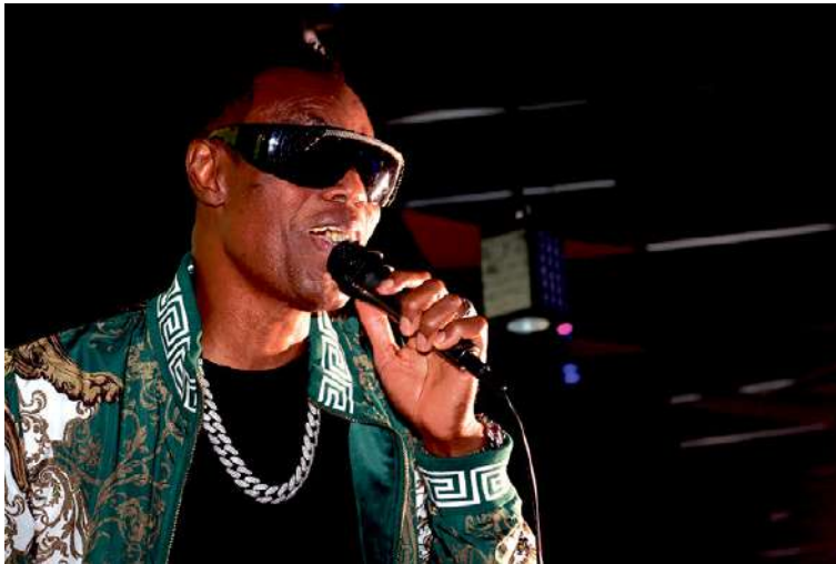
Singer Wayne Wonder was among the performers at the Golden Krust National Jamaican Patty Day Tour in Miami.