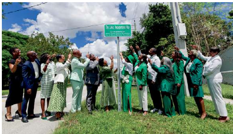
Local lawmakers and Links, Incorporated leaders celebrated the renaming of 12th Avenue stretching between Northwest 184th Drive and 189th Terrace in Miami Gardens, The Links, Incorporated Way.