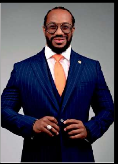
From Deportee To Parliamentarian ... Page 8